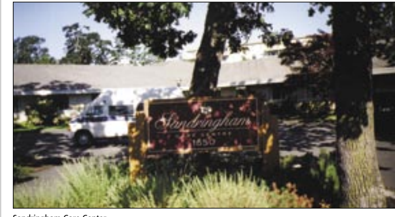
Sandringham Care Center