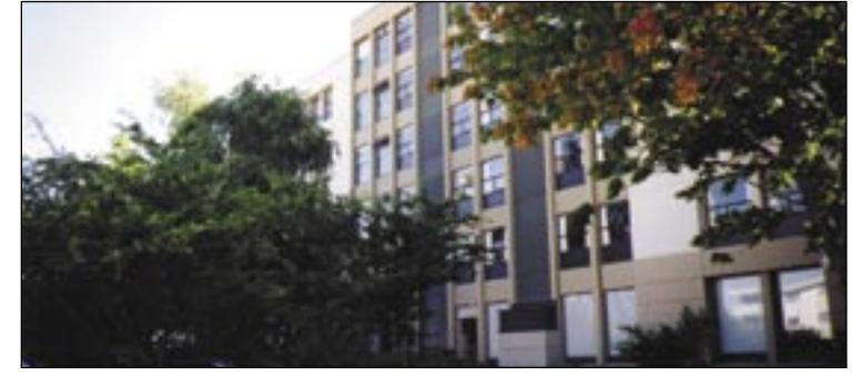
James Bay Care Center