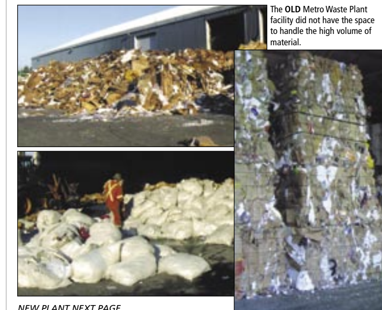
The OLD Metro Waste Plant facility did not have the space to handle the high volume of material.