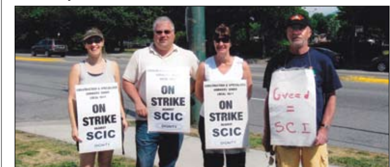
Local 1611 members on the SCIC picket line this past June.